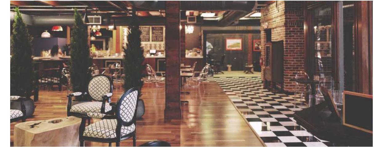
A five-star hotel?