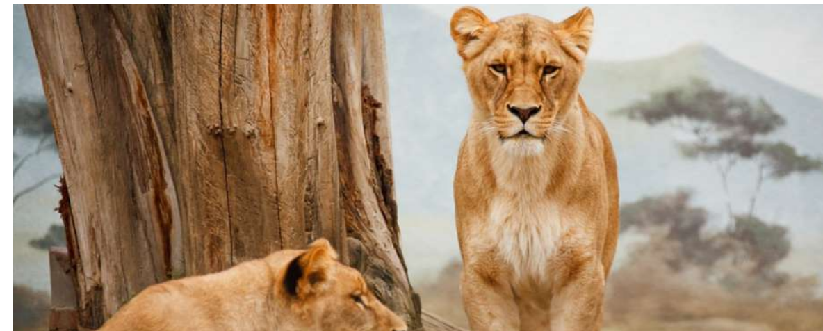
A safari tour?