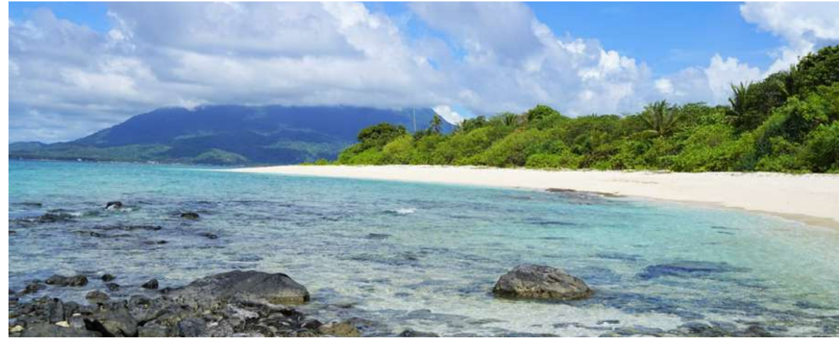
A deserted island?

Work in pairs/groups. Discuss. You have 3 minutes. Which five things would you take to: