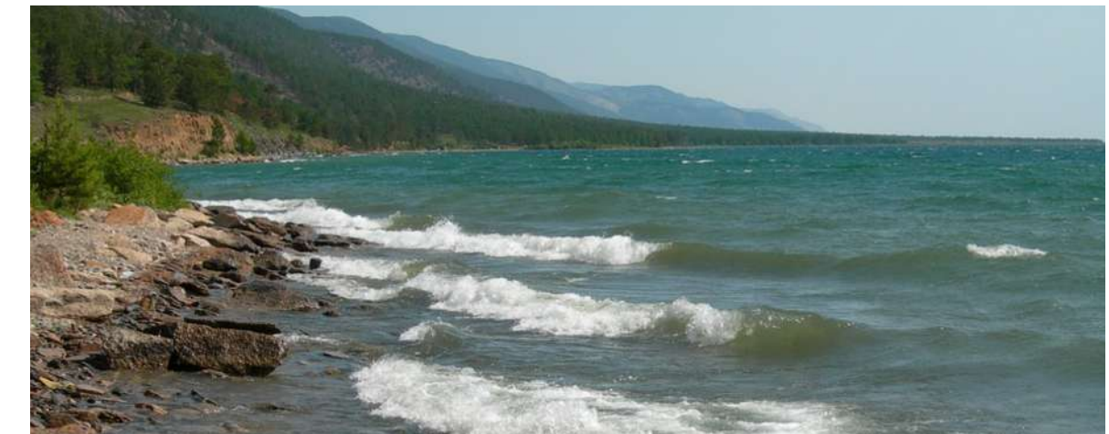
A trip to Baikal?