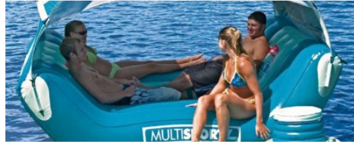
A cruise around the world on an inflatable lounge?