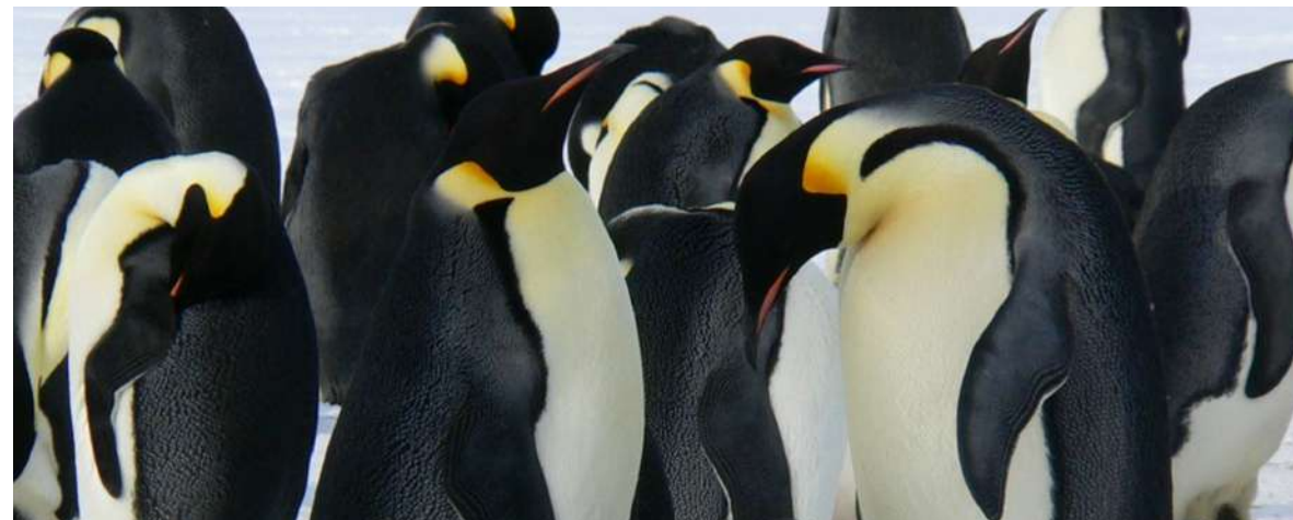
An expedition to the Antarctic?