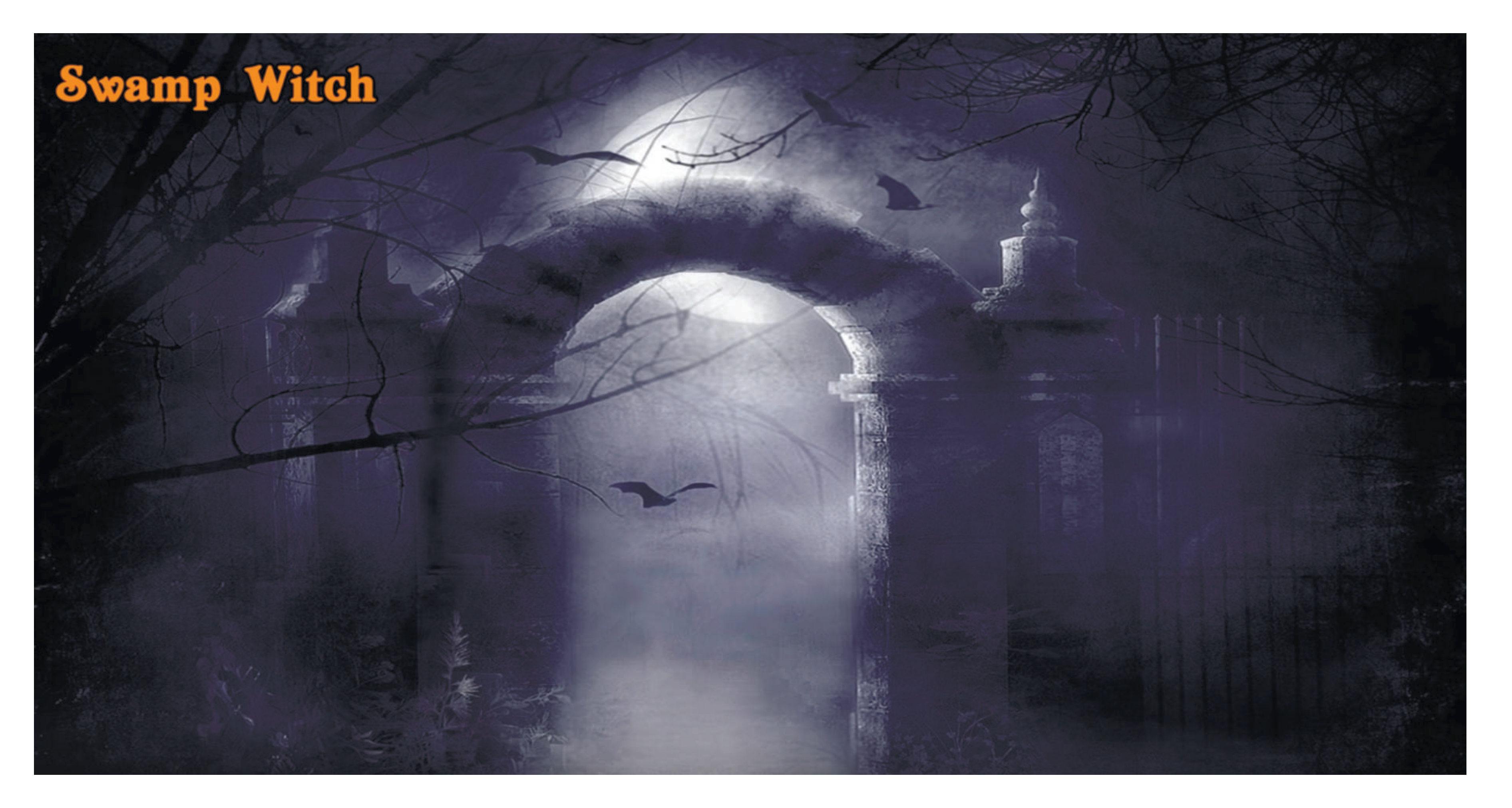
Task 1 Listen to the music (about 1-3 minutes). What associations do you have?