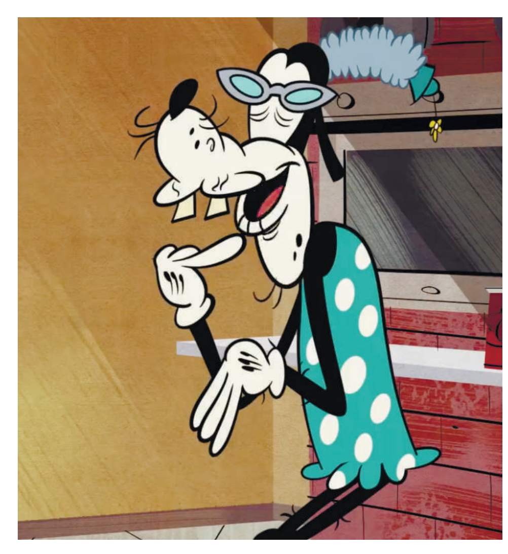
Has Goofy got a typical, usual granny?