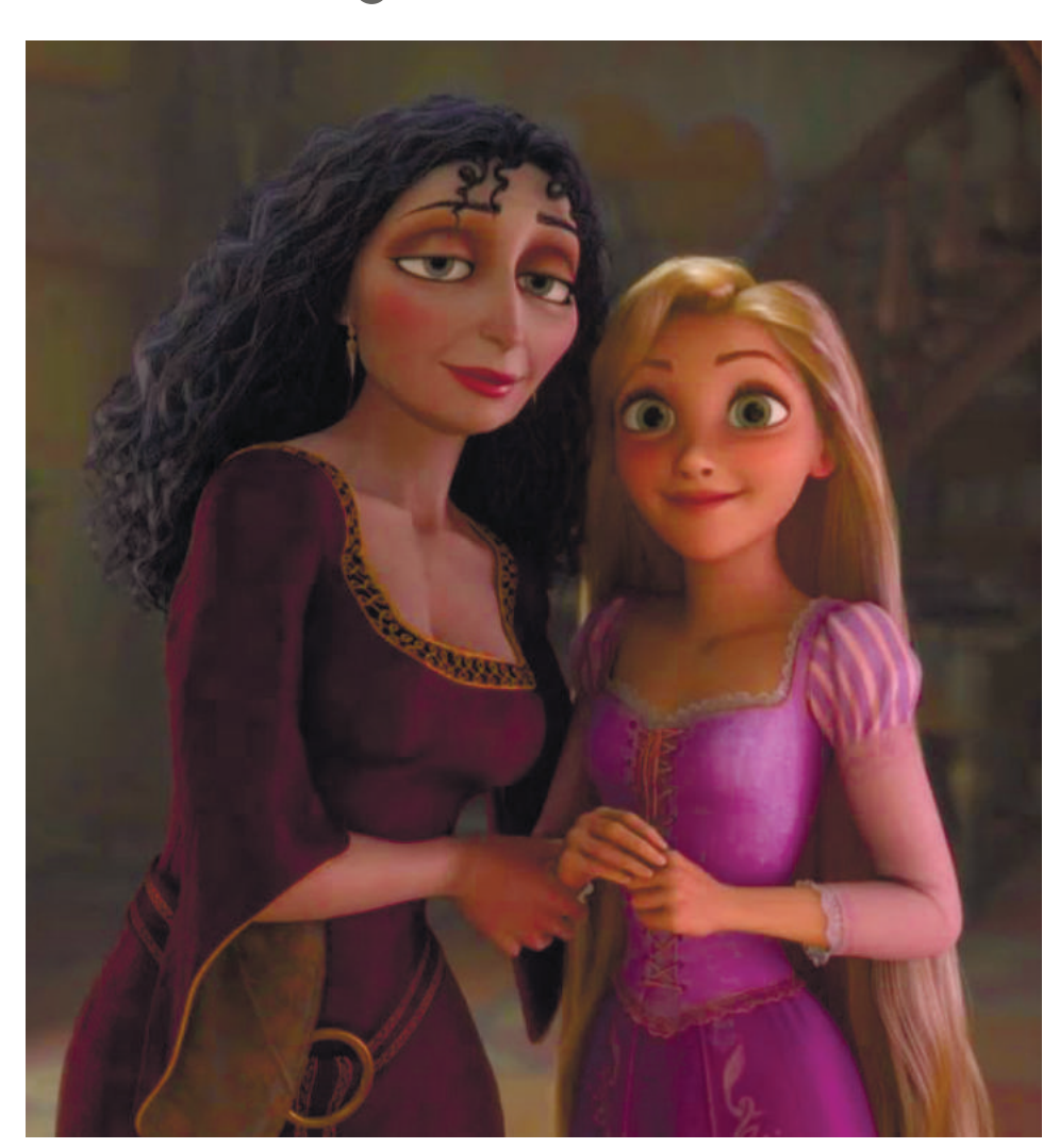
What's wrong with both "mommies" in these cartoons?