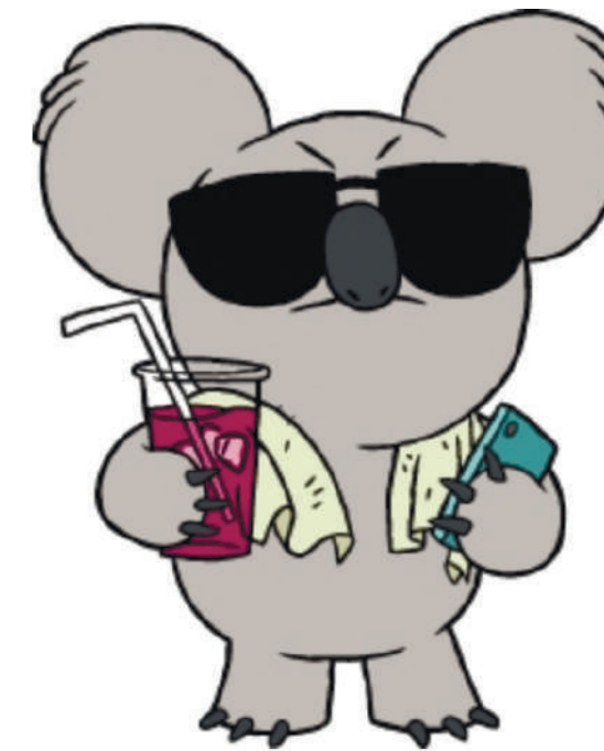
Nom Nom (NN)