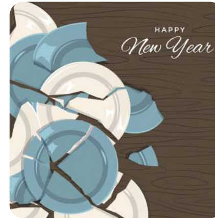
to mess up